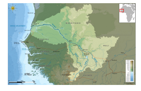
Map of the Senegal River