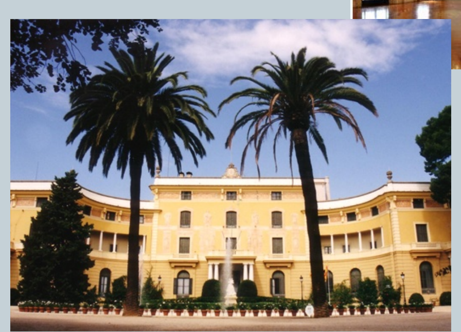
(Pedralbes Palace XVII Century)